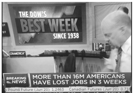
Metrics Without Meaning

Careerism is the answer to and the cause of life's meaninglessness. Metrics with no meaning marketed as receipts of genius. Every tech and financial innovation superstar is some sort of variant of this sham that can somehow loose massive amounts of money while making fortunes for a small cadre of executives. It doesn't seem real because it isn't. It is only happening because we sucked the confused cloud and have allowed the logic of these careerists to shape our relationship to who we are, what we do, and how we interact with each other.